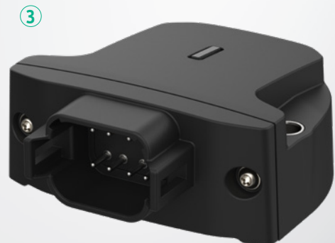
③ Deutsch DT04-08PA