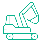
Dynamic machines (e.g. excavators, dumpers, self-propelled sprayers)

→ MEMS technology + Sensor Fusion (Kalman filter)