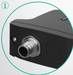
① 1x M12 5-pin (male)