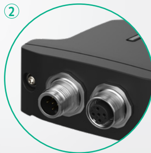
② 2x M12 5-pin (male/female)